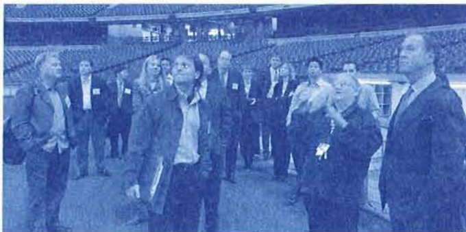
Conference attendees at Miller Park

After the final panel the NSLI hosted a reception for all attendees and speakers at the Howard Eisenberg Memorial Hall in the Marquette University Law School. Approximately 160 individuals representing 14 countries and 6 continents attended the conference. A limited number of conference materials are still available for purchase for $20.00 plus shipping and handling. For more information, contact the NSLI at (414) 288-5815, send an email request to munsli@mu.edu , or check the NSLI's website at http://law.marquette.edu/jw/pubs .